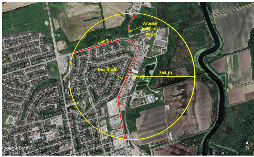
(Google Earth, imagery 2022)