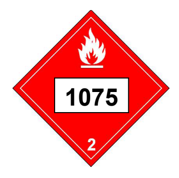
Figure 2: TDG Placard for Liquefied Petroleum Gas (LPG)

Propane is stored in its liquid form and can expand 270 times its size when converted to the gas phase. The proper shipping name of propane is Liquefied Petroleum Gas ("LPG") and the Transportation of Dangerous Goods ("TDG") placard for LPG in large means of containment is illustrated below in Figure 2. The placard shows that LPG is a Class 2 flammable gas with a UN (United Nations) Number of 1075.