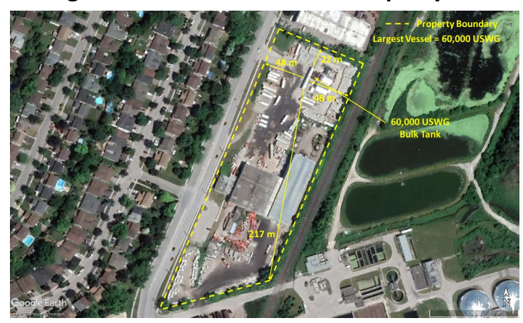
(Google Earth, imagery 2022)