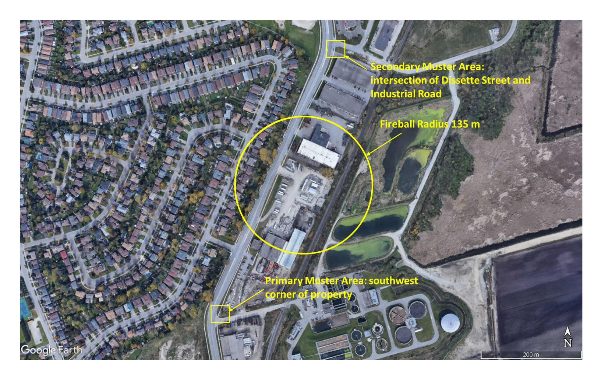
Last Updated: September 11, 2024