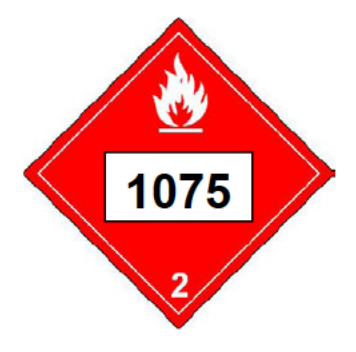
Figure 2: TDG Placard for Liquefied Petroleum Gas (LPG)

Propane is stored in its liquid form and can expand 270 times its size when converted to the gas phase. The proper shipping name of propane is Liquefied Petroleum Gas ("LPG") and the Transport of Dangerous Goods ("TDG") placard for LPG in large means of containment is illustrated below in Figure 2. The placard shows that LPG is a Class 2 flammable gas with a UN (United Nations) Number of 1075.